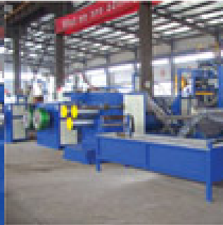
Single Wire Coiling