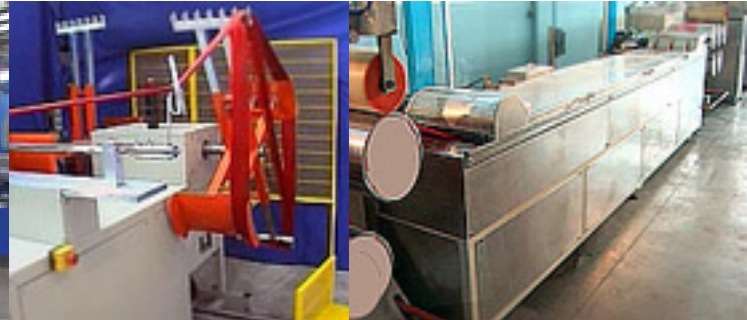
Single Wire Extension