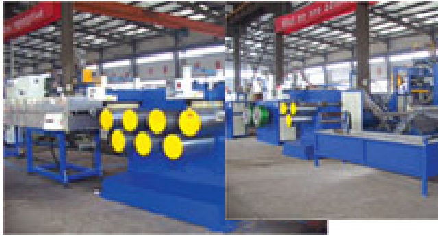
Cooling & Coiling