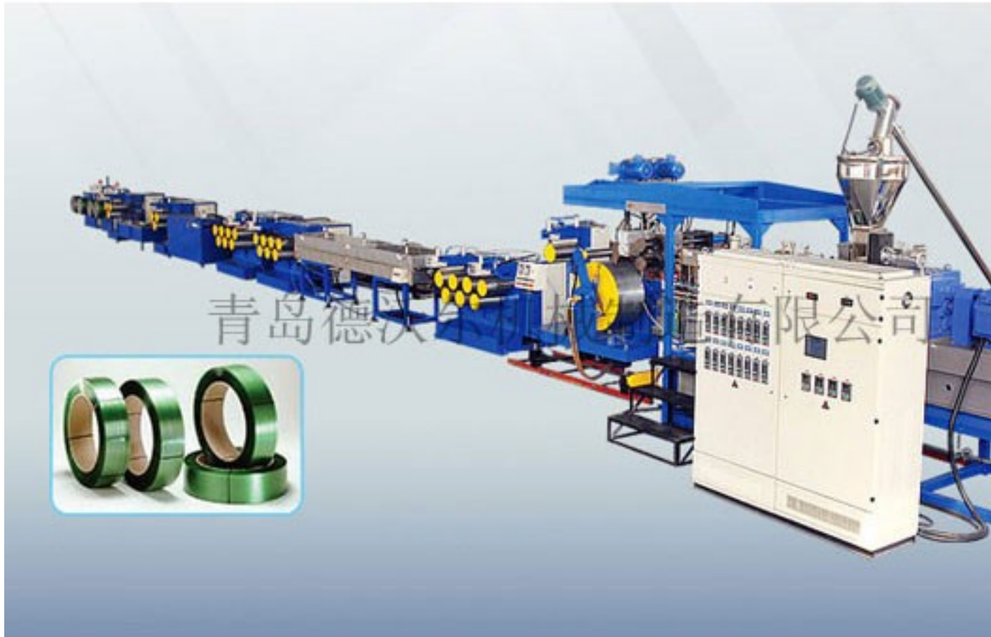
Single Wire Extrusion