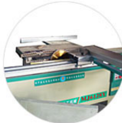
Wood saw right angle