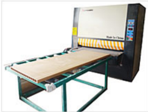
Wood Door CNC processing machines